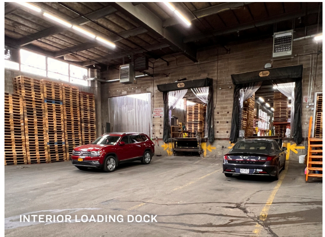
INTERIOR LOADING DOCK